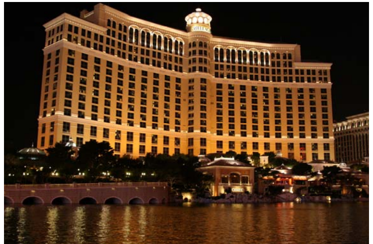
(bottom right) Bellagio