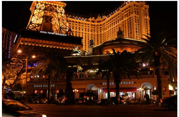
(top right) Paris Hotel