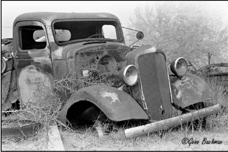
1st Place Final Resting Place by Gene Bachman B&W