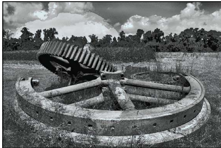
3rd Place Crop Circle by Randy Macon B&W