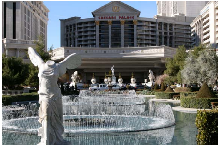
(left) Miss Wyoming and Miss Wisconsin (above) Caesars Palace