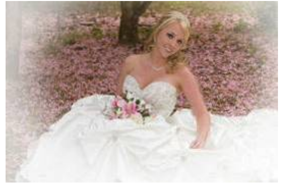
Bride by Bill Guillory

to 600 x 900 pixels (150 ppi at 4" x 6") and save as a high quality jpeg file (Photoshop jpeg quality of 8).