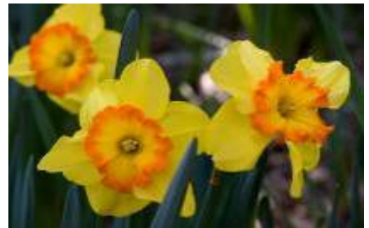
The Dandies by Earl Arboneaux