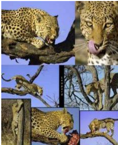
Leopard page by Reggie Keogh

to 600 x 900 pixels (150 ppi at 4" x 6") and save as a high quality jpeg file (Photoshop jpeg quality of 8).