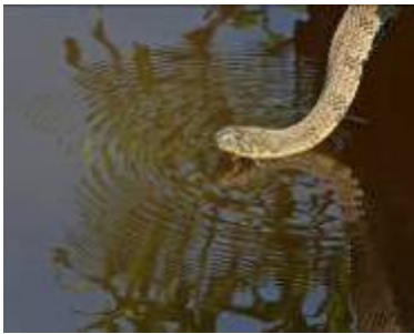
Diamond backed water snake by J. Hartgerink