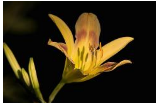
Daylily by Earl Arboneaux