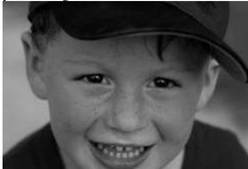
By Toni Goss

Want to learn Photoshop at your leisure, in your home ...free? Go to Google, enter "free Photoshop video tutorials" and you will see 151,000 sites with mini video tutorials on every aspect of Photoshop that you can imagine!