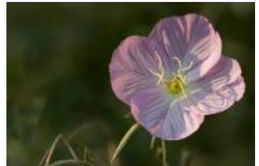
Primrose by Earl Arboneaux