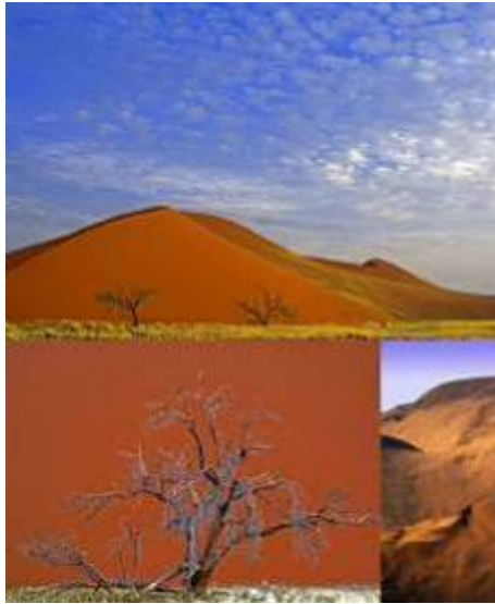
Dunes Page from Book by Reggie Keogh

Photoshop or use their templates. Attached are a pix of one cover and a couple of inside pages set up in Photoshop.