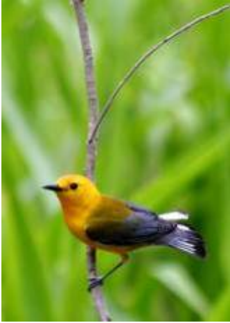
Prothonotary Warbler