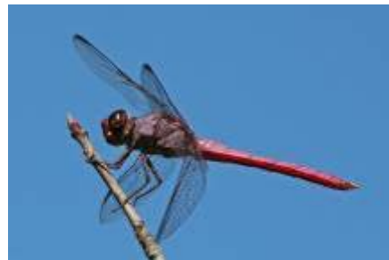
Roseate Skimmer