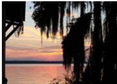
Lake Verret Sunset