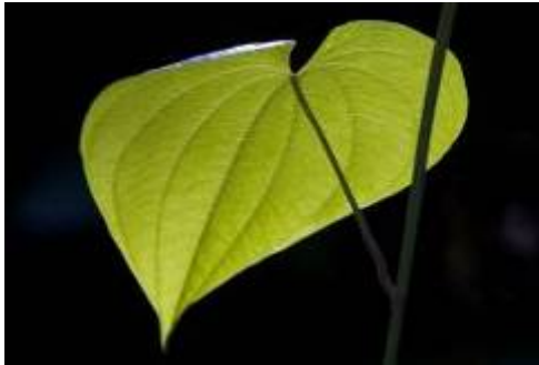
A Green Heart by Earl Arboneaux